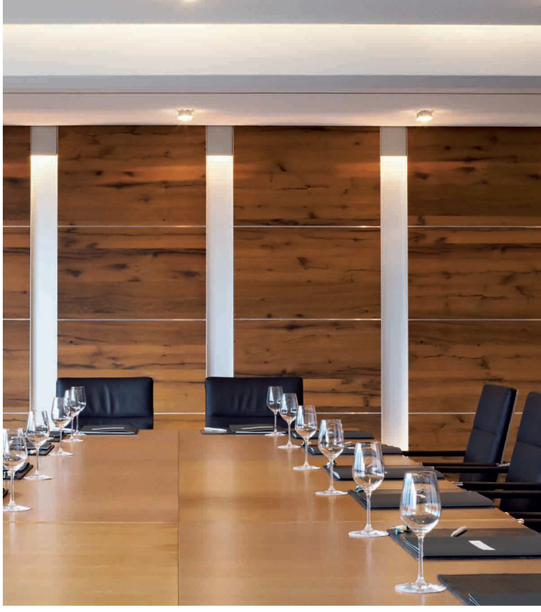
A high-quality setting for your event.