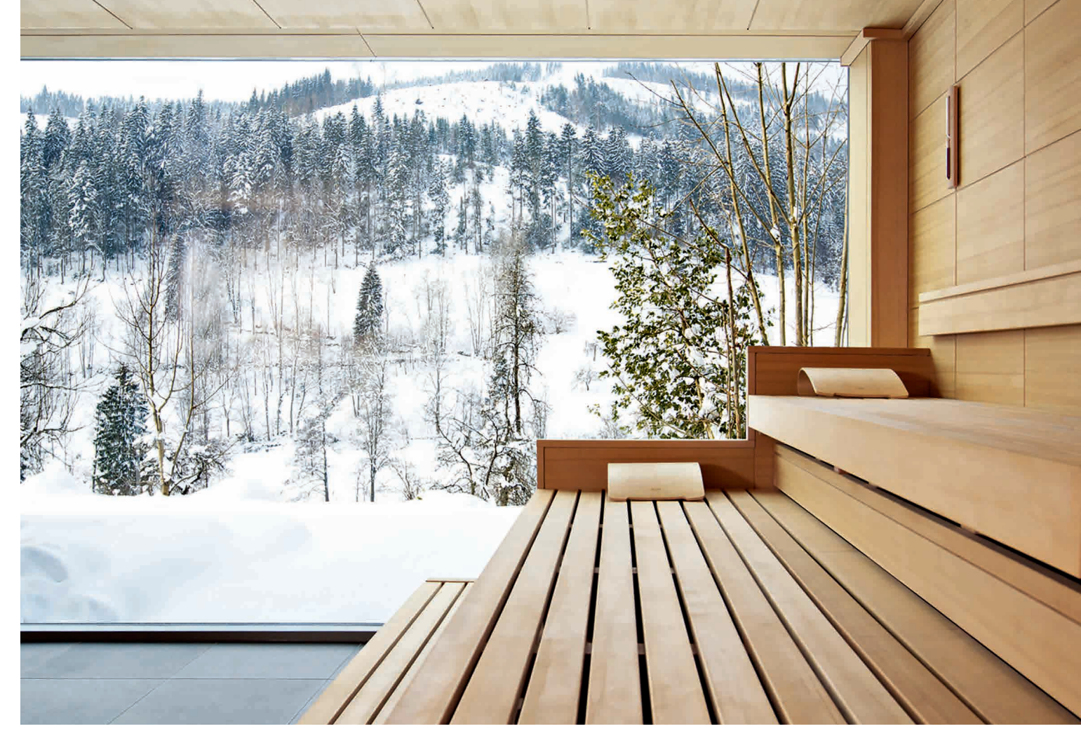
Modern sauna landscape with a superb panorama view: the family sauna in Haus Kohlwald