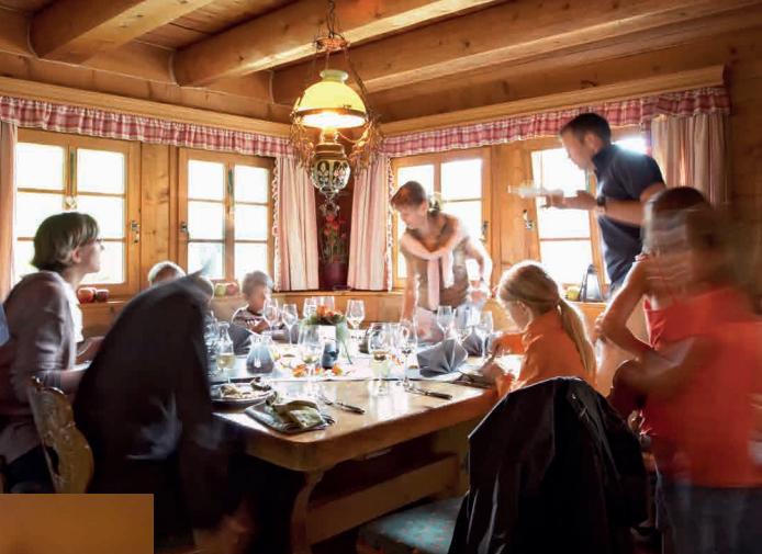
A rest after a walking tour through the Black Forest. – Can there be anything finer?