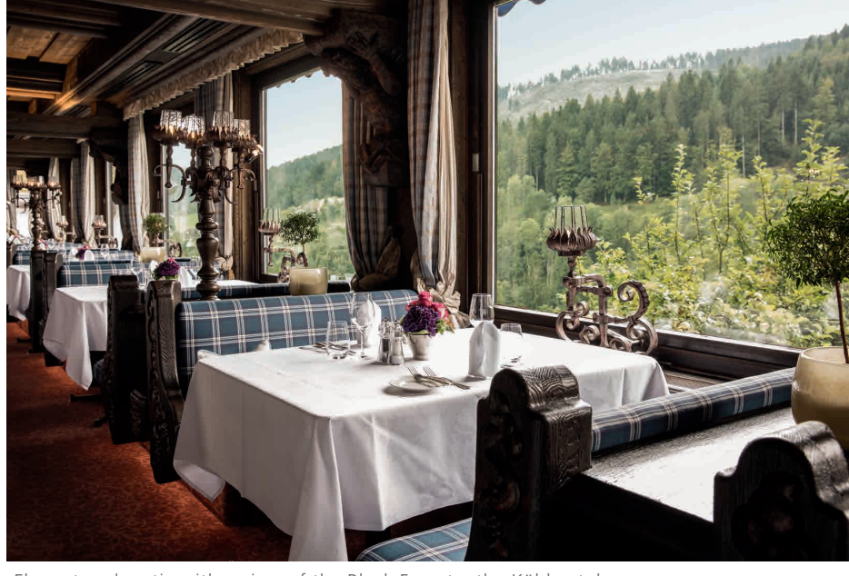
Elegant and rustic with a view of the Black Forest – the Köhlerstube.

Outstanding cuisine, an elegant setting and first-class service – this is what the Köhlerstube has to offer under the direction of chef Florian Stolte. Here you can look forward not just to culinary delights of the region prepared to the very highest standards but also a superb view of Tonbach valley.