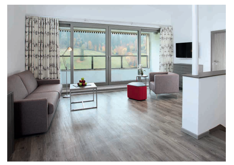
Suite in Haus Kohlwald.

Haus Kohlwald demonstrates what luxurious living is like in the 21st century. Generously sized family apartments, lots of light, an uncluttered view – and of course spa facilities with everything the heart desires.