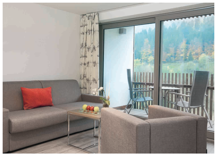
Living room and balcony with a view of the Black Forest.