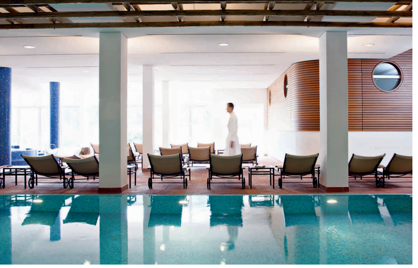
Indoor pool in the main building.