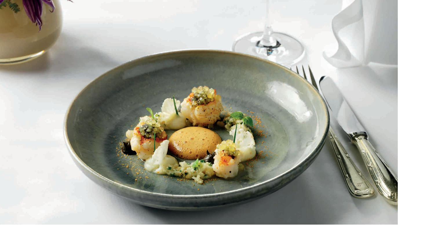
The atmosphere is rustic. Excellent regional cuisine is served. That's our Bauernstube.