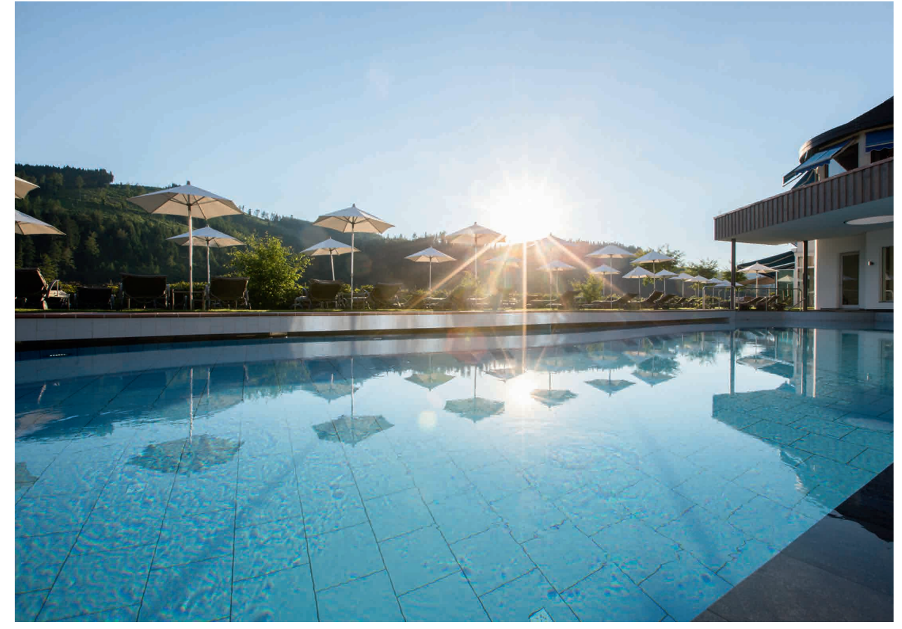
Swim your lengths against the backdrop of a Black Forest panorama.