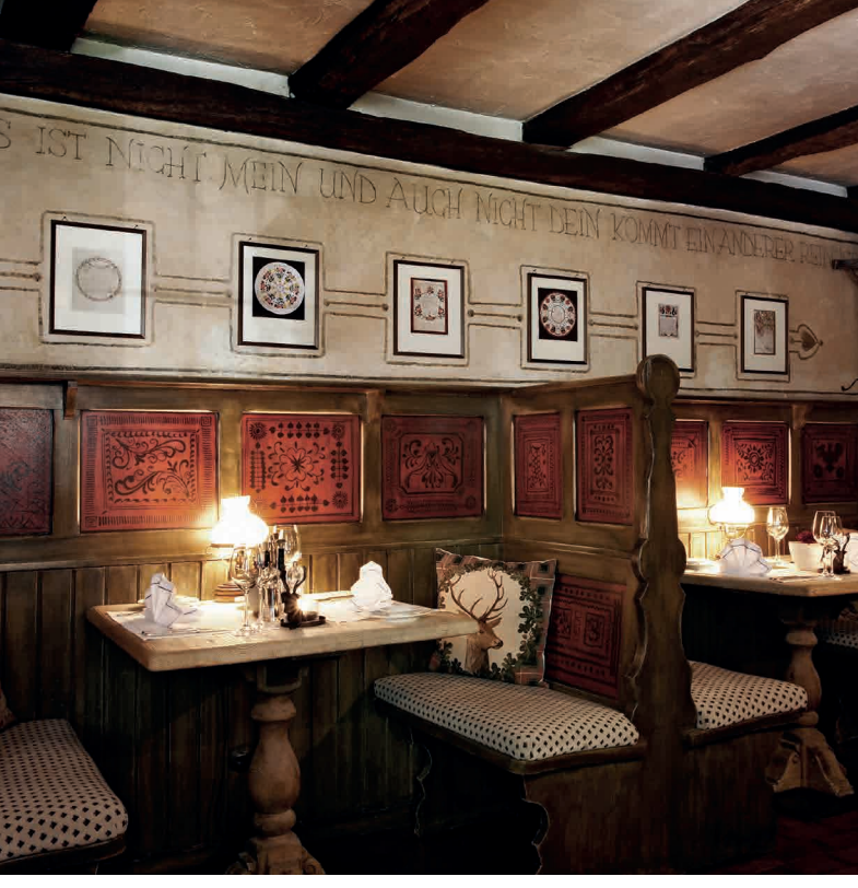
The Bauernstube – affectionate attention to detail.